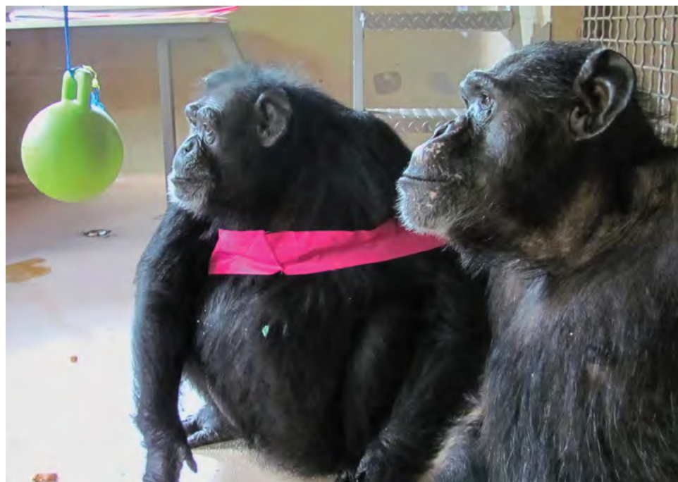
Sue and Pepper—two classy ladies

What is a true friend? A single soul dwelling in two bodies. —Aristotle