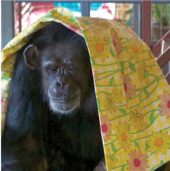
Sue Ellen in disguise

If you're going through hell, keep going. —Winston Churchill