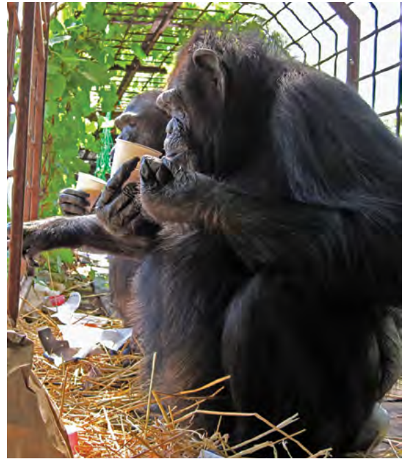
Tea for two